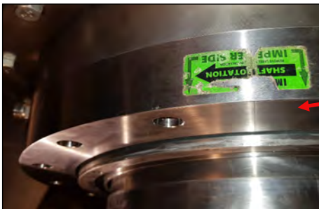
Turbine Bottom Seal with SpiralTrac Installed