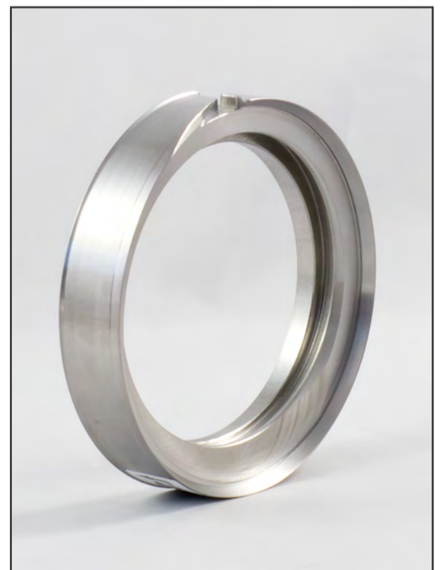
SpiralTrac Version N Type I

For more information please send an email to us at support@enviroseal.ca . We hope to hear from you!